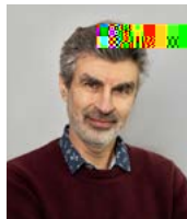
Yoshua Bengio Scientific Director / Mila, Full Professor / U. Montreal